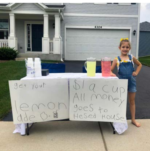
Above: Donors of all ages continue to ensure Hesed House is able to serve our neighbors in need.

*Virtual meeting held via Zoom due to COVID-19.