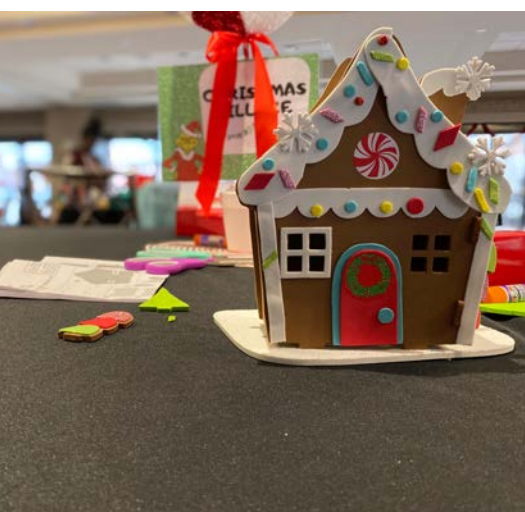
Above: A special donor held a festive Christmas celebration for all of our Family Shelter Guests in December of 2019.